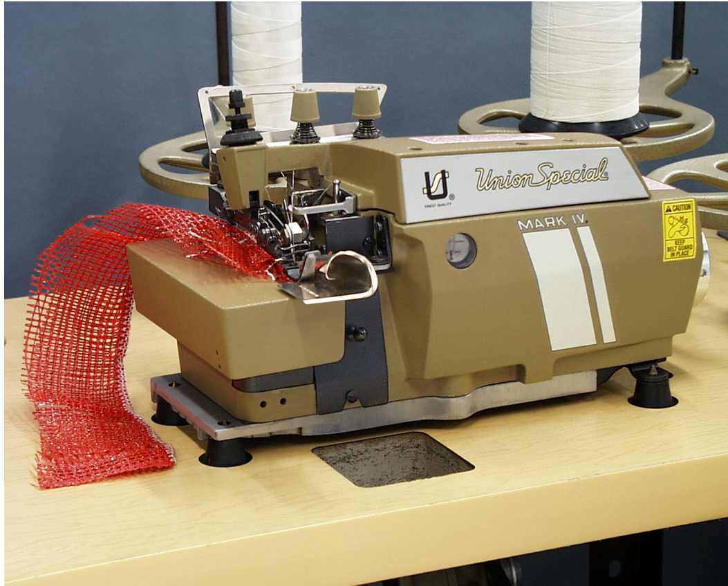
39500TYA with Sewing Table UH239G130