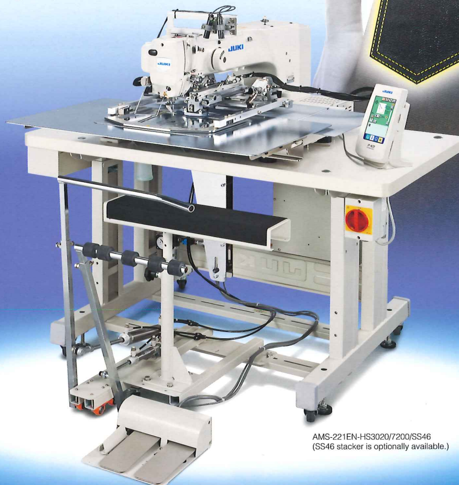
AMS-221EN-HS3020/7200/SS46 (SS46 stacker is optionally available.)