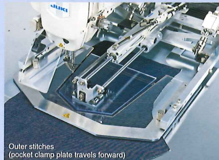
Outer stitches (pocket clamp plate travels forward)

※Entry prohibition area in which interference between the needle and the pocket clamp plate is prevented exists for the respective pocket sizes.